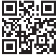
ABB Ability™ Smart Sensor for mounted bearings